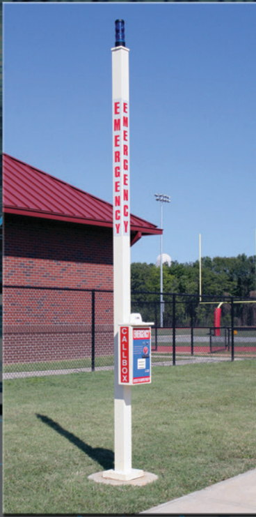
AC Surface Mount Stanchion