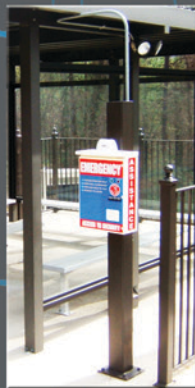
Bus Stop Pole