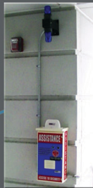
Parking Deck Column