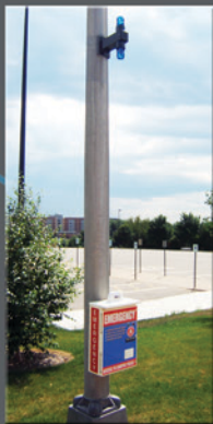
Existing Light Pole

The versatile applications of the CALL24 S-Series Callbox makes it the most affordable and reliable security protection on the market today.