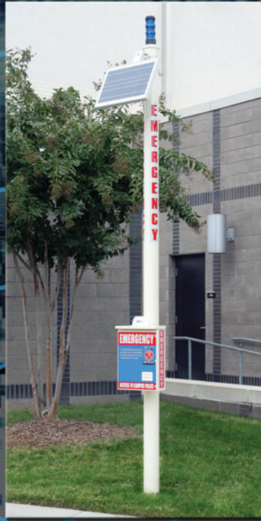
Solar Direct Burial Stanchion