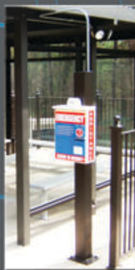
Bus Stop Pole