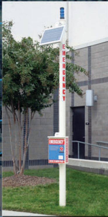
Solar Direct Burial Stanchion