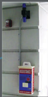
Parking Deck Column