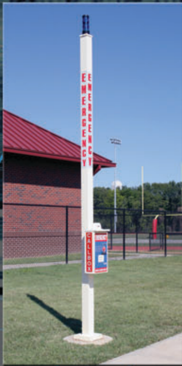
AC Surface Mount Stanchion