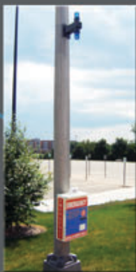
Existing Light Pole

The versatile applications of the CALL24 S-Series Callbox makes it the most affordable and reliable security protection on the market today.